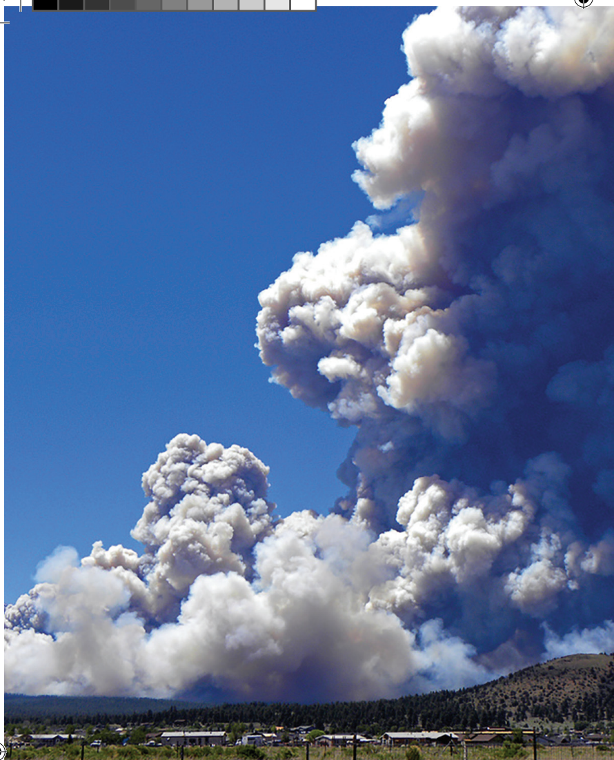
The Schultz Fire burns near Flagstaff, Arizona, in 2010.

generate a visceral fear. Yet wildfires are different in one important respect. When hurricanes and tornadoes strike, no one tries to stop them.